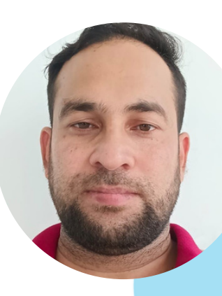
FERDUS Leo Dormitory (Kaki Bukit District)

His efforts have successfully strengthened the social support system for his peers.