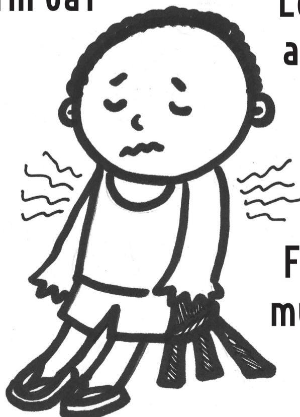
Fatigue and muscle aches