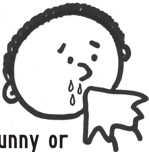
Runny or blocked nose