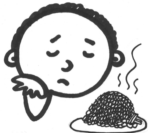
Loss of smell and/or taste